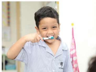
Preventing Dental Issues: 3