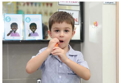
Making it Fun: 4

By introducing the importance of brushing teeth early on, we lay the foundation for lifelong oral hygiene habits. Teaching EY students about regular brushing not only prevents tooth decay and gum disease but also promotes their overall well-being.