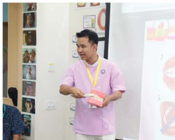
Building Lifelong Habits: 1

This new academic year, we chose to prioritize the oral health of Early Years (EY) students. Recognizing the significance of proper dental care habits at a young age, a new initiative has been introduced to emphasize the importance of brushing teeth. Let's explore the benefits of brushing teeth for EY students and how this initiative can positively impact their dental health.