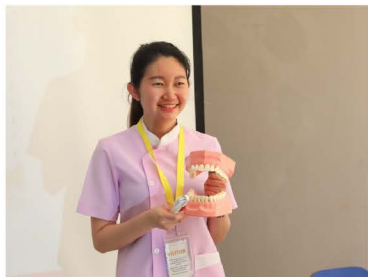
Preventing Dental Issues: 2